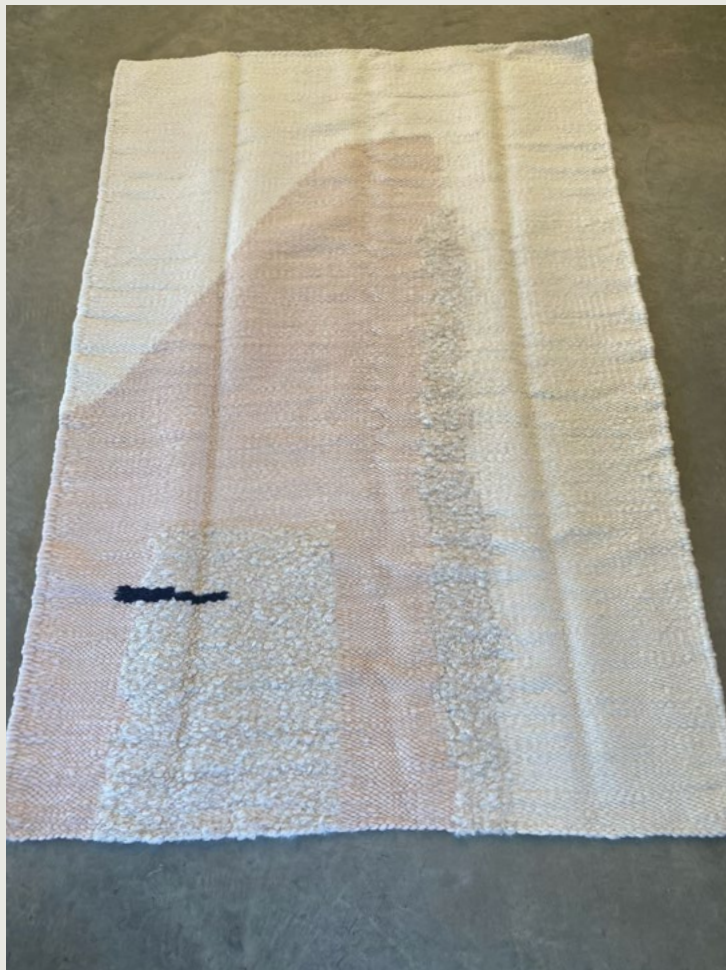
MAAH SALVAGED NUDE