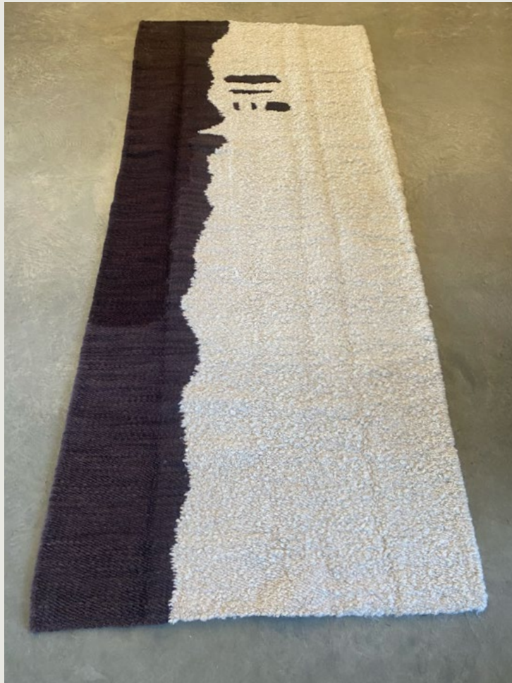
MAAH SILENT RUST WHITE CHOCOLATE