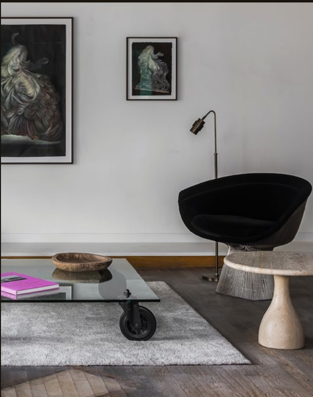
GALLERY Kustlaan 132/9 Knokke-Heist Open on weekends & school holidays

The Gallery in Knokke-Heist serves as an open showroom blending together with art from Dauwens-Beernaert Gallery, open every weekend and on school holidays. The warehouse Studio in Evergem (Gent) is the place to meet, rent as a shooting location, organise expos, warehouse sales or have private appointments.