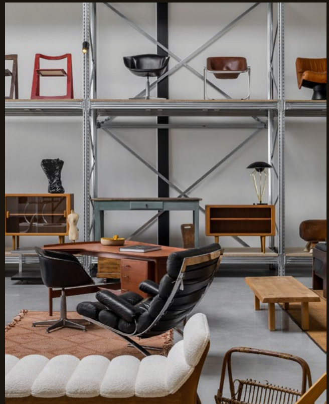
WAREHOUSE STUDIO Durmakker 25A/20 Evergem Open on appointment