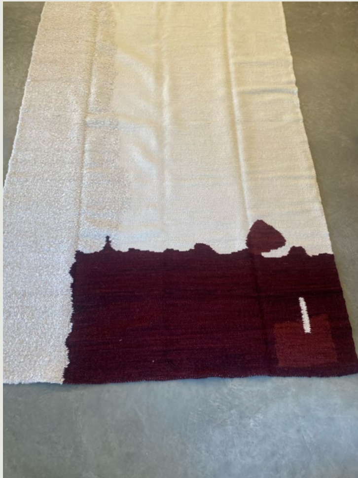
MAAH SHADOW LIGHT WHITE RUST