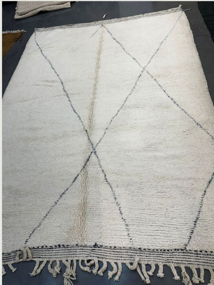
MOROCCAN HANDMADE WITH WHITE & BLUE LINES