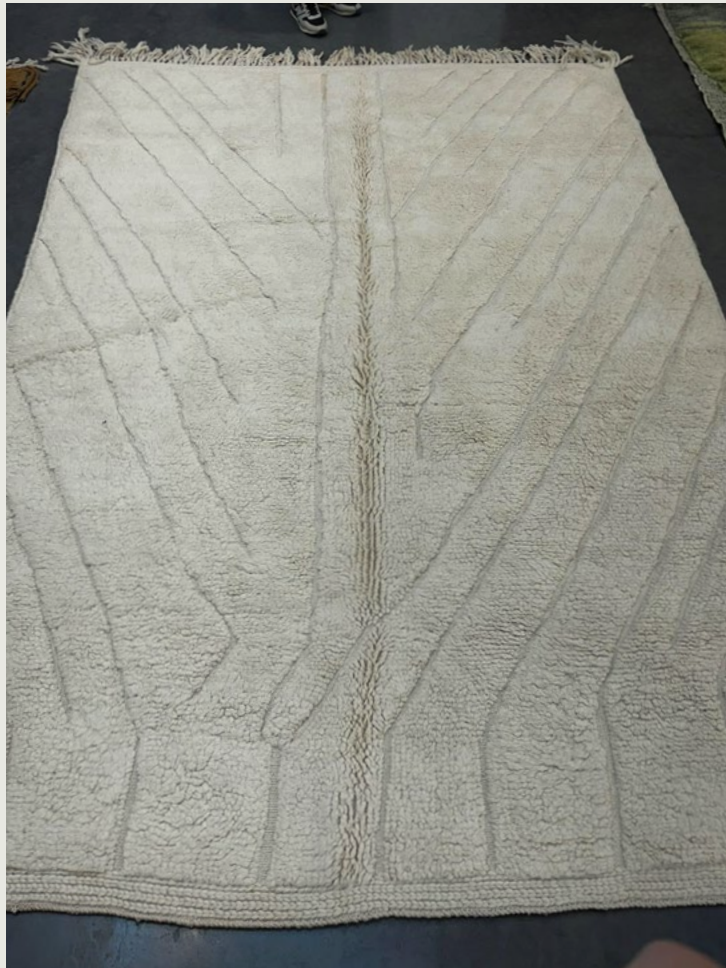
MOROCCAN HANDMADE WITH WHITE LINES