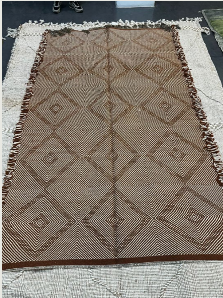
MOROCCAN HANDMADE KILIM SMALL BROWN WITH SQUARE MOTIFS