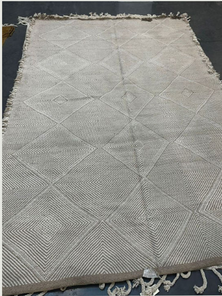
MOROCCAN HANDMADE KILIM SMALL BEIGE WITH DIAMOND MOTIFS