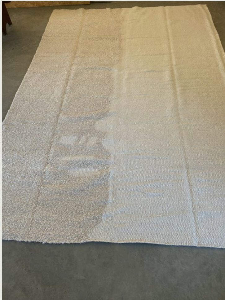
MAAH SILENT RUST WHITE