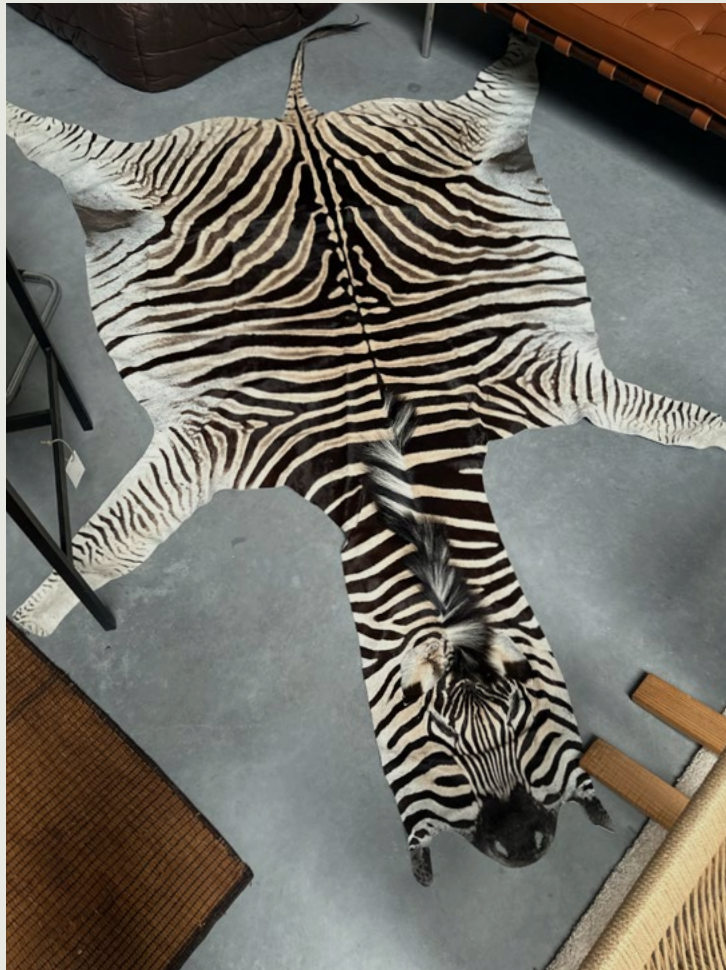
SOUTH AFRICAN ZEBRA SKIN