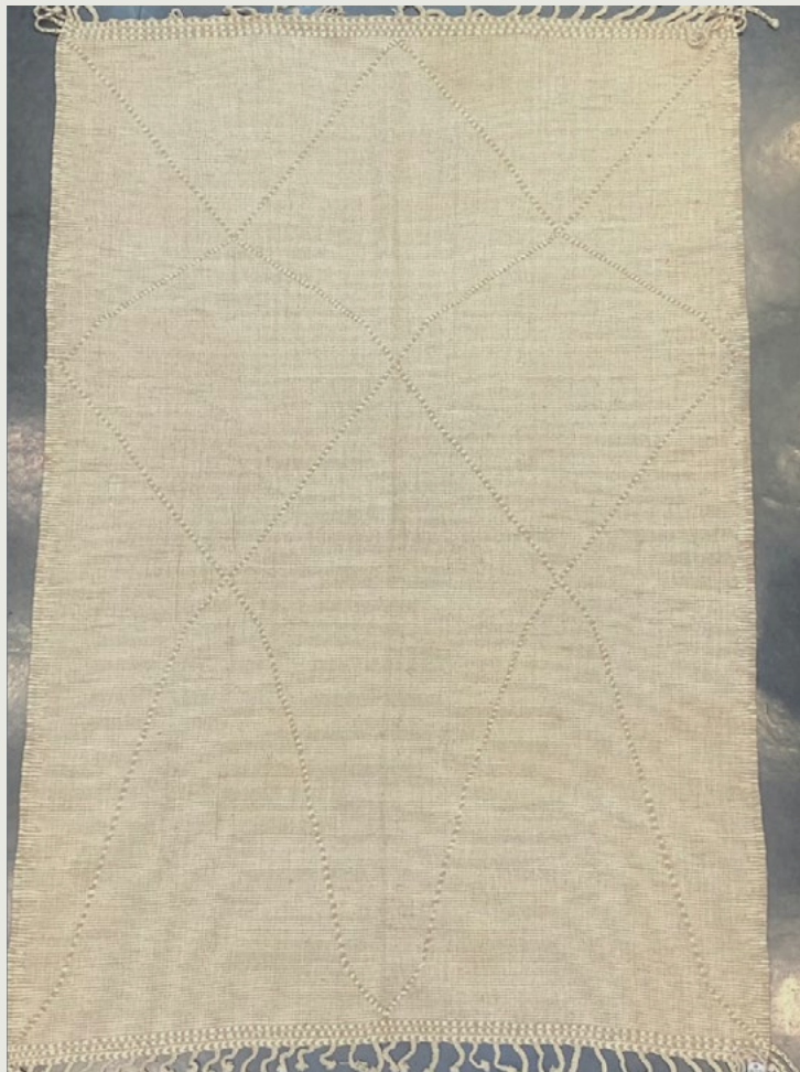
SOUFIANE ZARIB BEIGE WITH MOTIF (LARGE)