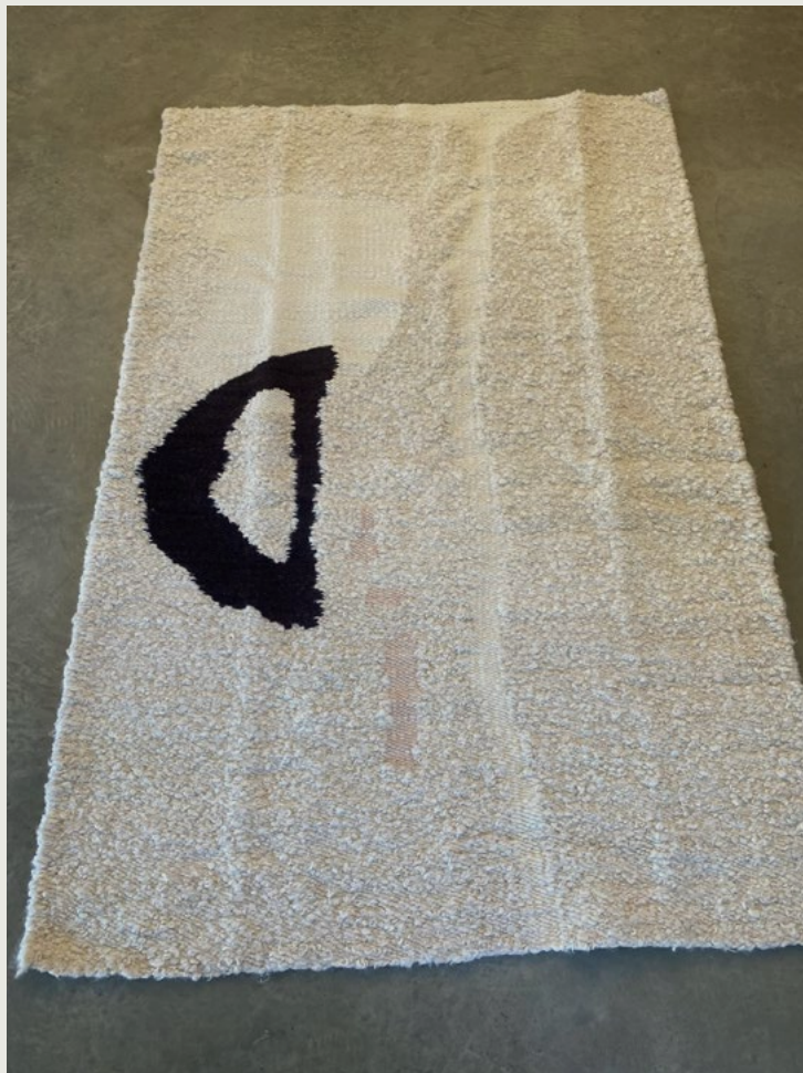
MAAH DAPPLED LIGHT DARK CHOCOLATE