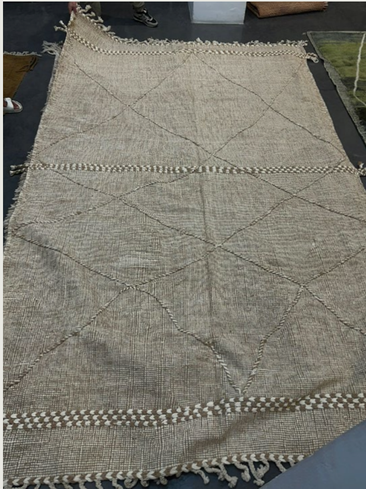
MOROCCAN HANDMADE KILIM SMALL BEIGE WITH 3 STRIPES